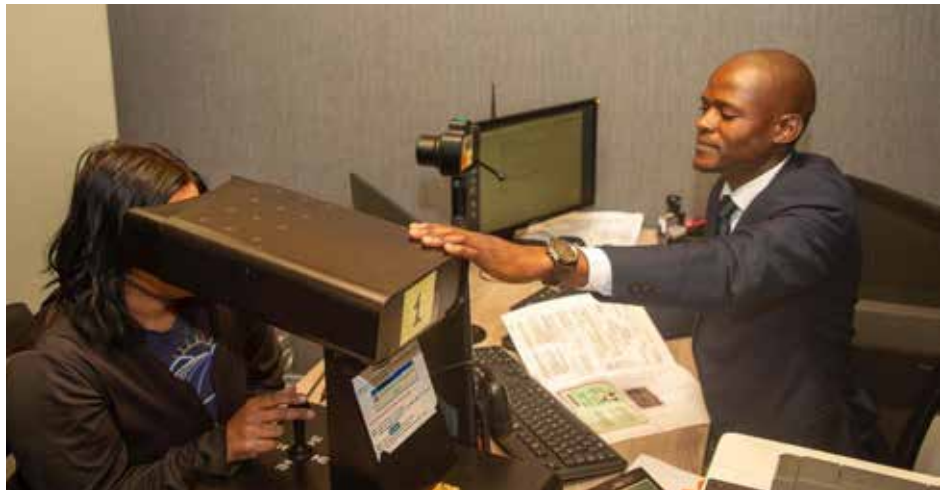
The centre, built using alternative building materials, is completely off the grid, guaranteeing customers minimal disruptions and quick, convenient service along the Gautrain line.

The centre will only offer cashless services and will operate from 8 am-5pm Monday to Friday and from 9 am-3 pm on Saturdays and Sundays.