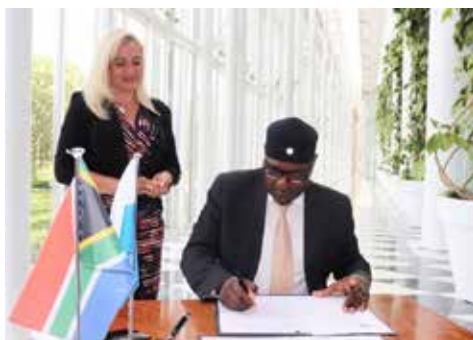
Premier David Makhura signs a Memorandum of Understanding with the Free State of Bavaria's Minister of International Affairs Melanie Huml focusing on climate change, energy, automotive, education, safety and security.