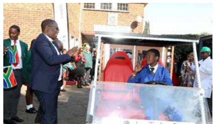
John Orr Engineering SoS is showcasing their solar-powered car, equipped with a sound system