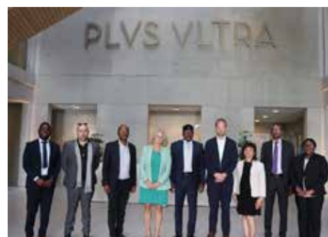
The Gauteng delegation visited Wageningen University to engage on finding ways to turn Gauteng province to a food system innovation hub.