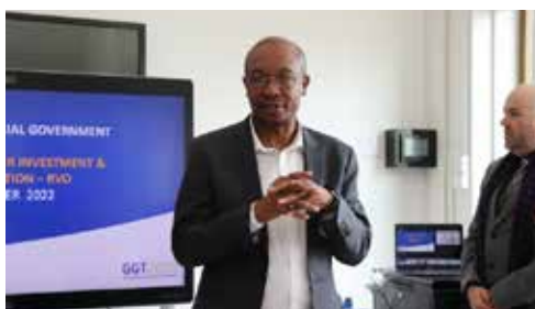
The Gauteng delegation met with the Netherlands Enterprise Development Agency. The two sides will soon sign an all-encompassing MOU which includes agriculture, green hydrogen, waste energy and digital innovation.

"We envision new cities and industrial nodes anchored on the deployment of hydrogen," said Makhura.