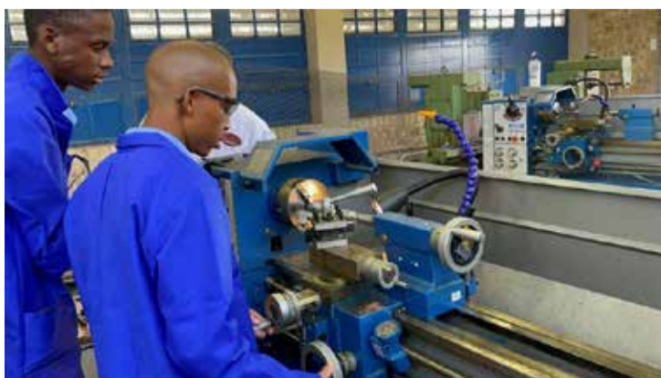
Learners at Ekangala Engineering School of Specialisation demonstrate critical industry skills such as welding.

The department said they planned to launch many more schools of specialisation because they equip learners with the necessary skills to begin work, entrepreneurship or freelancing in industries with high economic activity. ■